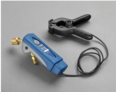
67001 Single Pressure Gauge