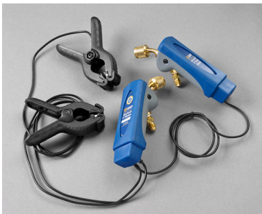
67002 Dual Pressure Gauge