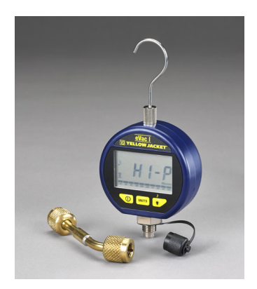
eVac I (69047)