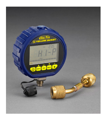
eVac Pro (69051)