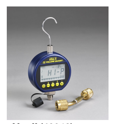
eVac II (69048)