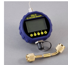
69050 Protective Gauge Boot