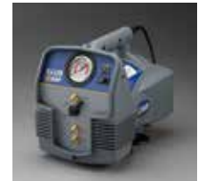
95732, 95733, 95738