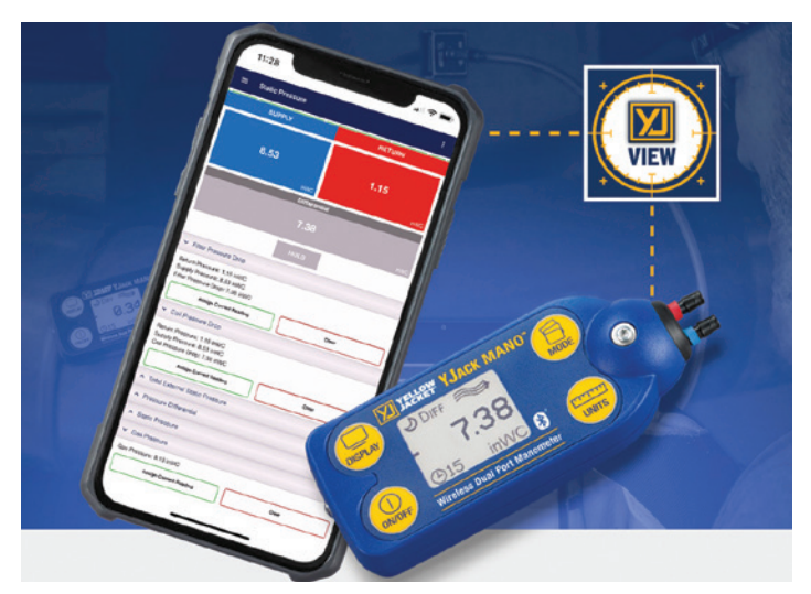
The 2-IN-1 Advantage