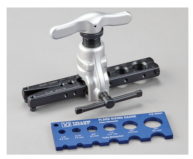
With Flare Sizing Gauge, the service tech has all the information for completing flaring pipe connections.