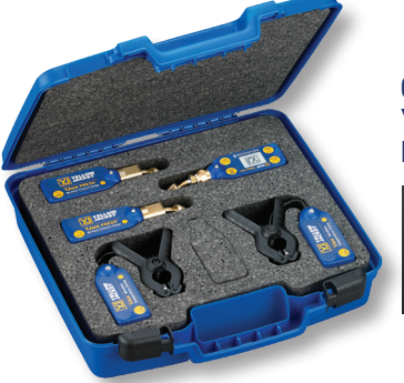
YJACK<sup>®</sup> Charging & Air Kit