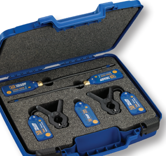
67071 YJACK® Temperature/ Humidity Kit