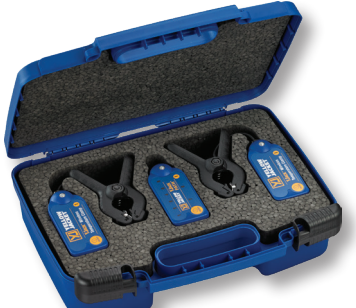
67070 YJACK® Temperature Clamp Kit