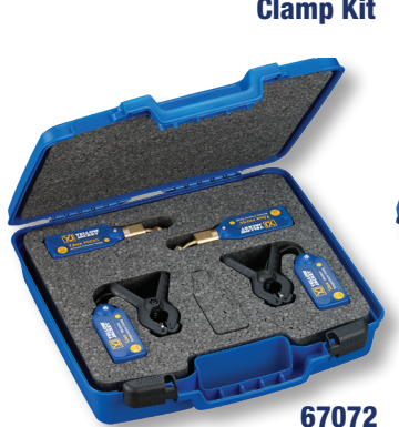
67072 YJACK<sup>®</sup> Charging Kit