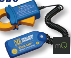
67067 YJACK AMP® Current Probe