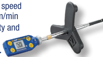
67069 YJACK FLOW™ Anemometer