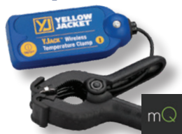
67061 YJACK® Temperature Clamp