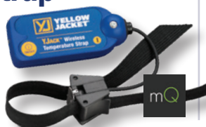
67062 YJACK® Temperature Strap