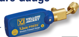
67065 YJACK PRESS® Pressure Gauge