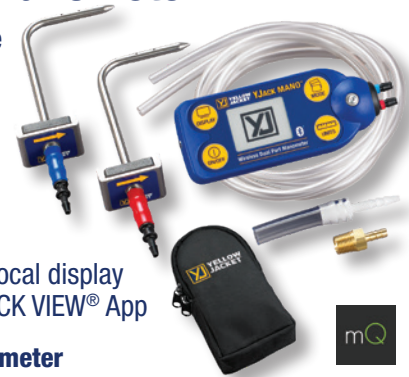
67068 YJACK MANO® Manometer