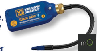
67063 YJACK DEW® Psychrometer