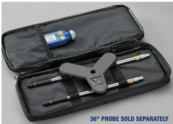
36" PROBE SOLD SEPARATELY

The YJACK FLOW™ Wireless Anemometer by YELLOW JACKET® is the newest member of the YJACK® Series of Wireless Probes. The YJACK FLOW™ P/N 67069 measures the air speed in ducts and ventilation systems. YJACK FLOW™ takes accurate air flow measurements up to 30 m/s, measuring the entire duct flow to account for turbulence or completes a single line air flow for fast duct-to-duct flow comparisons.