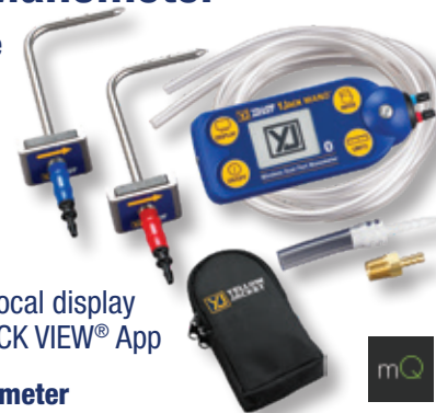
67068 YJACK MANO® Manometer