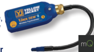
67063 YJACK DEW® Psychrometer