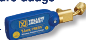
67065 YJACK PRESS® Pressure Gauge