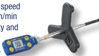
67069 YJACK FLOW™ Anemometer