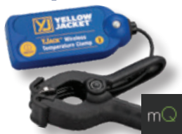
67061 YJACK® Temperature Clamp