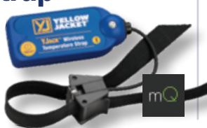
67062 YJACK® Temperature Strap