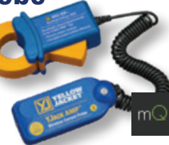
67067 YJACK AMP® Current Probe